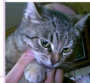
American Shorthair Size: Small Age: Young Sex: Female