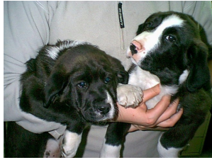
St. Bernard Mix Size: Large Age: Babies Sex: Male