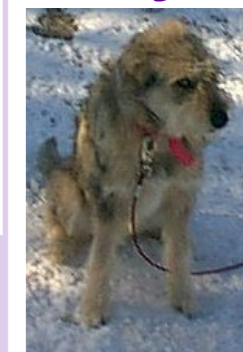
Airedale Mix Size: Medium Age: Young Adult Sex: Male