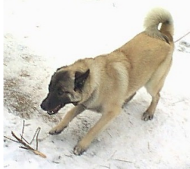
Shepherd Mix Size: Medium Age: Young Sex: Male